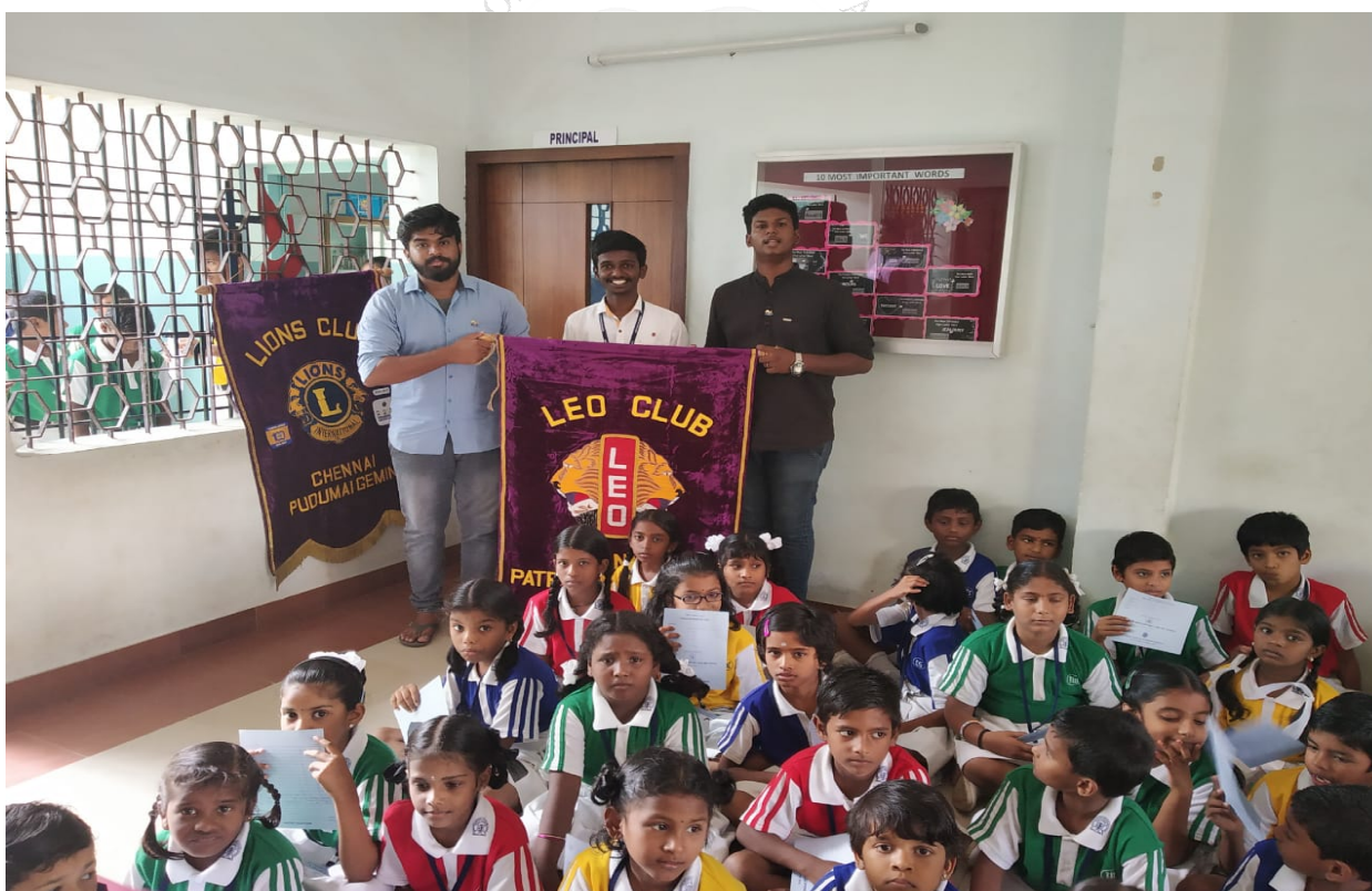
26.10.2018 - Leo Club members at the Health Camp