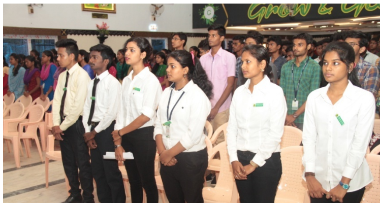
Office Bearers participated in an Awareness Program on the Needs and Rights of Transgenders in India