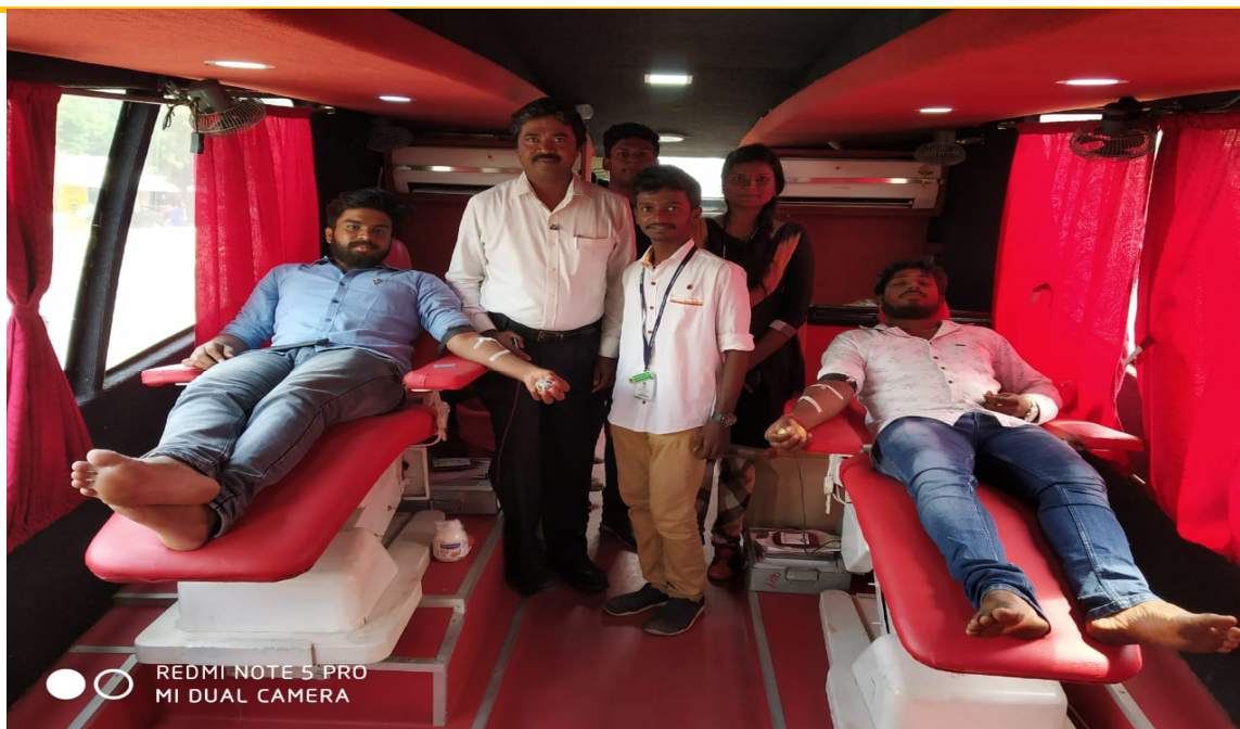
26.10.2018 - LEO Club members donating blood